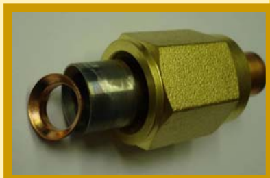
Machined flare adaptor

Care should be taken to ensure that the copper gasket is installed correctly and that the flare adaptor is tightened to the correct torque using a torque wrench spanner. These machined flare adaptors can also be used on the indoor unit if there is not sufficient space to remove the flared connections and braze directly onto the stubs.