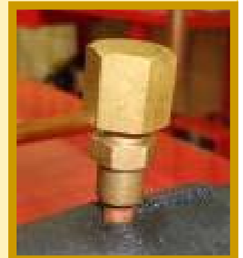
Hexagonal nut cap (preferred to reduce potential leakage)

Based on material provided by Scott Gleed of Ceilite Air Conditioning, Cool Concerns Ltd and the REAL Zero project