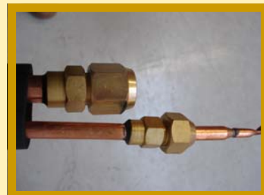
Flared joint to be removed